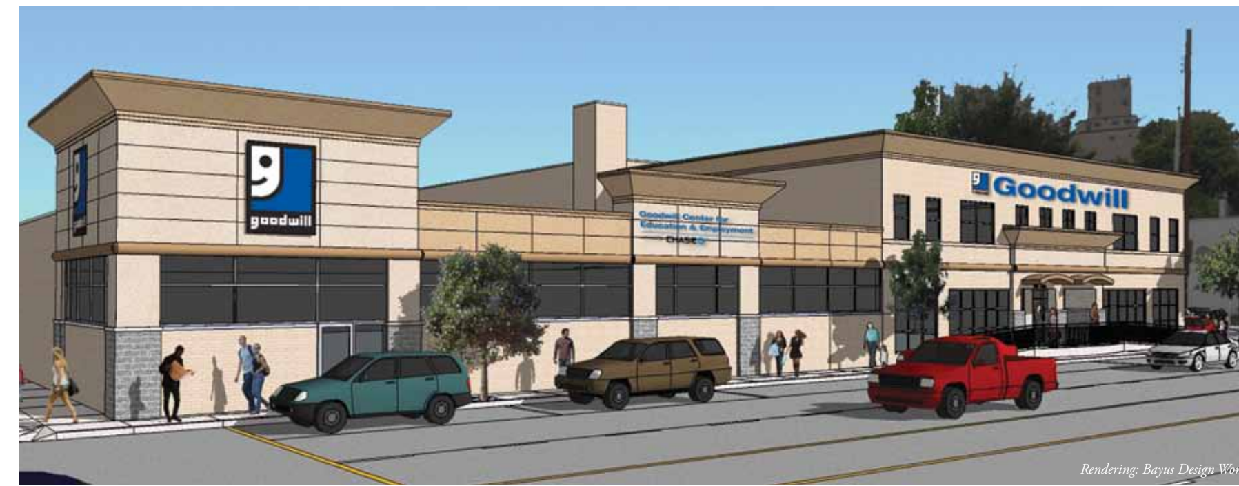
Above is a proposed rendering of the Goodwill Center for Education and Employment, powered by Chase, and the existing donation and retail center.